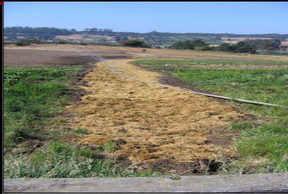
A 500 foot grassed waterway was successfully installed at ALBA's Triple M Ranch in Monterey County.